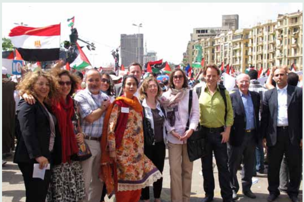
The Global Migration Futures team with some of its stakeholders in Tahrir Square, Cairo, during a demonstration in favour of religious unity.